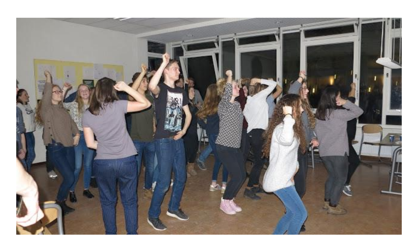
All in all, this was a good day with lots of excitement and new impressions. Sure to last for a life time!