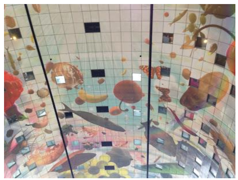
More from the ceiling.

We were also told about how Rotterdam was bombed during the Second World War, and that the city therefore had to be rebuilt almost from scratch.