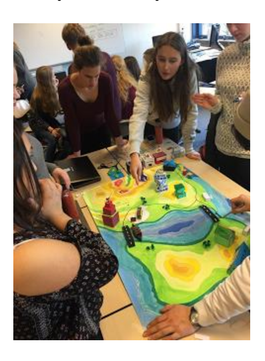
Friday 27. January

At the end of the day, we had one more little post on the programme, and that was to visit a museum called 'het schip' (the ship). It was interesting to learn about how the workers of Amsterdam took things in their own hands and started building houses for themselves with a much better standard than they had from before.