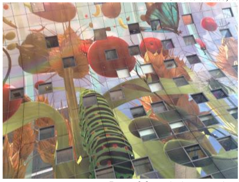
Part of the painting covering the ceiling.